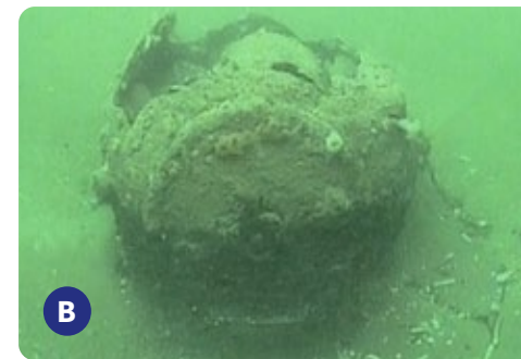
A WROV equipped with UXO inspection equipment