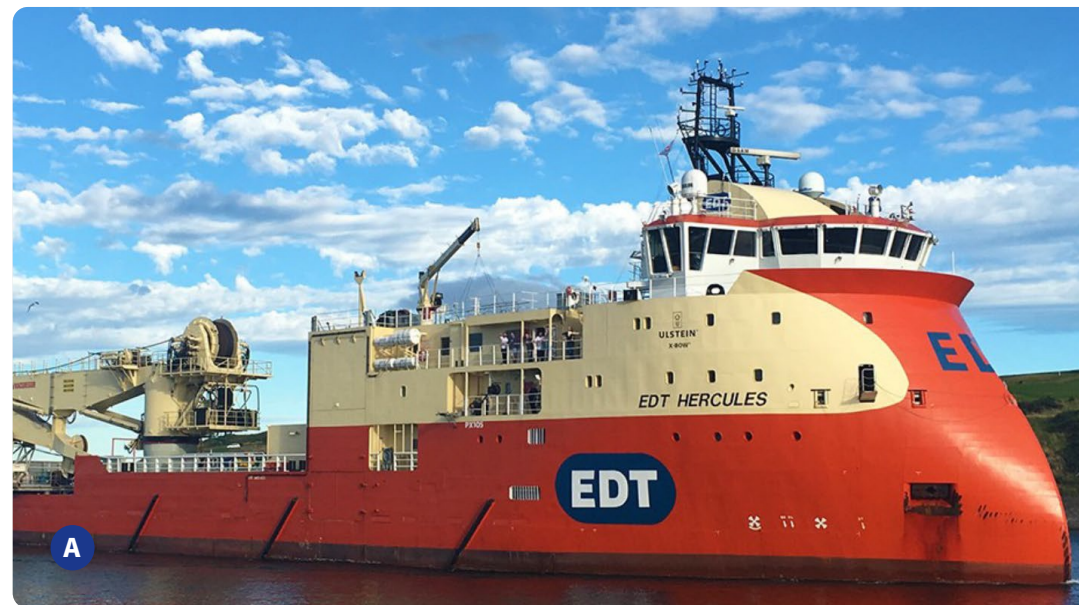
A OSV EDT Hercules