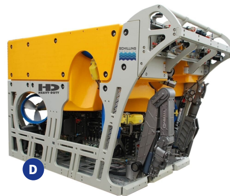
B Debris removal by WROV C Magnetic target response from potential UXO D WROV installed on board EDT Hercules